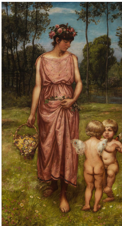
Fig. 4: Hans Thoma (1839–1924), Flora , 1882, oil on paper, mounted on canvas, 113 x 62 cm.