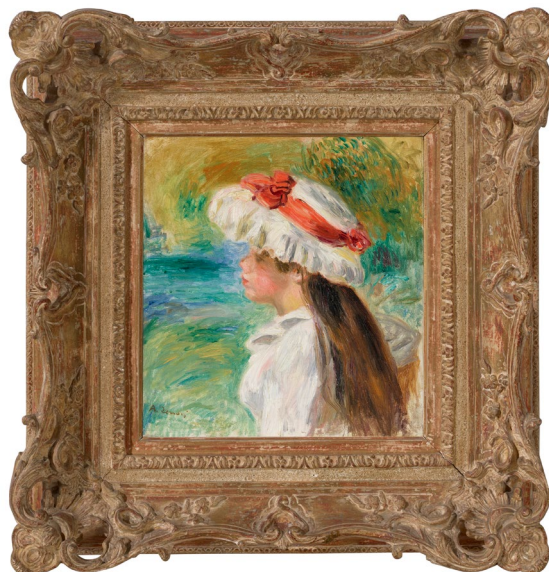
Fig. 2: Pierre-Auguste Renoir (1841–1919), Head of a young girl wearing a garden hat , ca. 1895, oil on canvas, 28.2 x 26 cm.