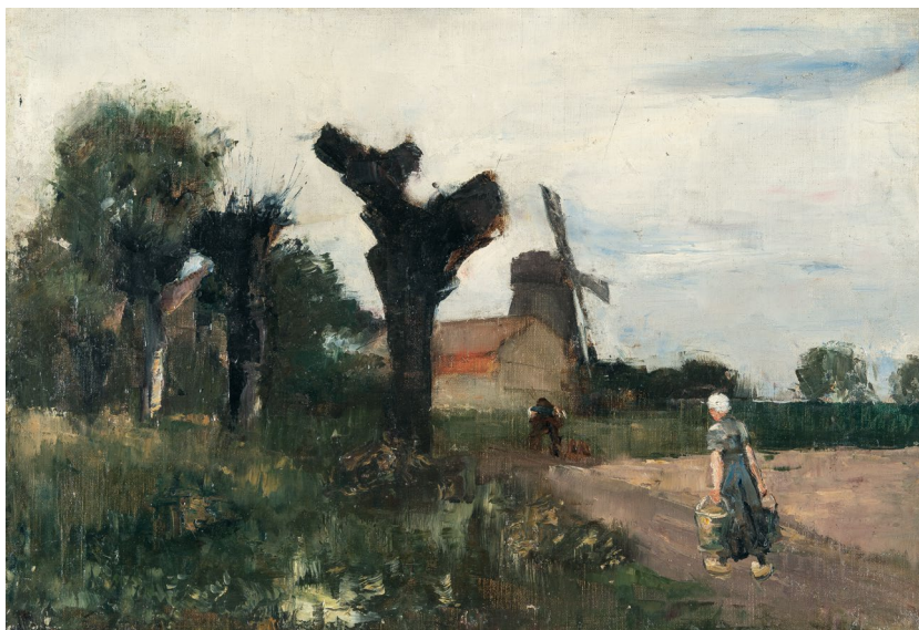
Fig. 1: Lesser Ury (1861–1931), The Way to the Mill , ca. 1880, oil on canvas, ca. 36 x 52.5 cm.